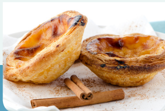
Pastel de Belém

Buffet breakfast. This morning we'll get to know the old and monumental Lisbon that was the capital of the world in the 15th Century. At the riverside suburb of Belem, we'll visit the church of the Hieronymus Monastery, the jewel of Manueline art, and the Belem Tower, built between 1515 and 1519 to defend the river mouth and the Hieronymus Monastery. Enjoy a "Pastel de Belém" pastry a typical Portuguese delight. Remainder of the day free. In the evening you will be picked up at your hotel for a farewell dinner at one of Lisbon's Portuguese Fado Houses. You will enjoy dinner and typical songs that create the feeling that the Portuguese people call "saudade".