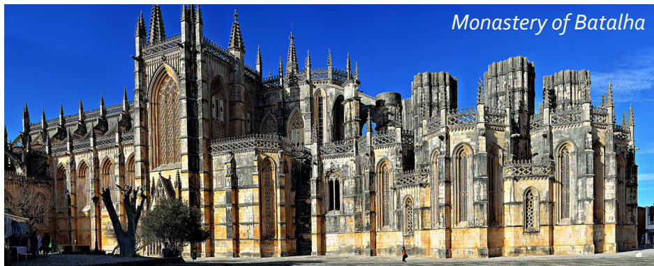
Monastery of Batalha